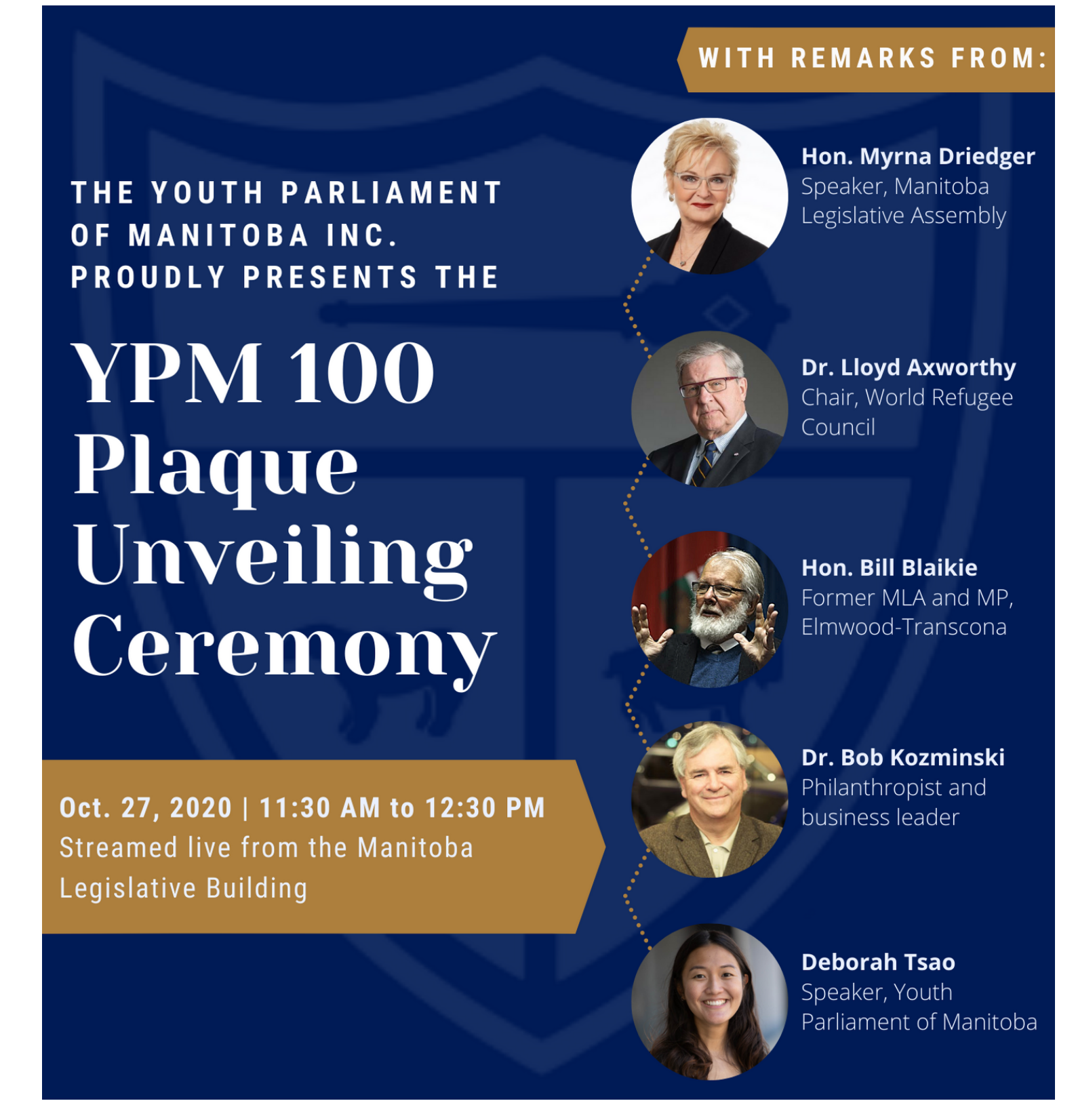
Image Description: Flyer for the YPM 100 Plaque Unveiling Ceremony. October 27, 2020 from 11:30-12:30pm.

Welcome to this issue of the Youth Parliamentarian - your alumni newsletter for updates about the Youth Parliament of Manitoba. In this month's issue, you will find information about the YPM100 Plaque Unveiling , some updates about YPM and COVID-19 , and a monthly alumni spotlight featuring Kady Evanyshyn .