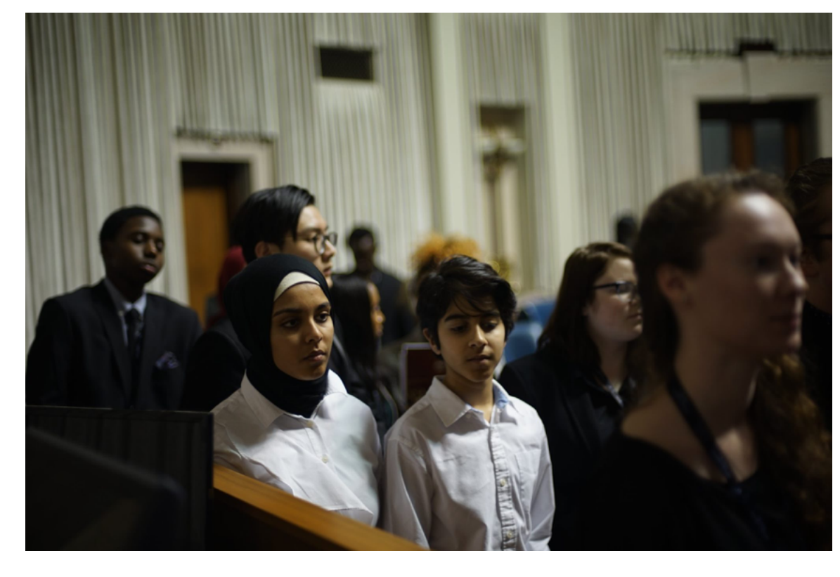
Image description: Members and pages line up in the Legislative Chamber during the 98th Winter Session (December, 2019)

The unveiling ceremony formally kicks off our YPM100 year in 2021! All alumni and wider community members are welcome to attend.