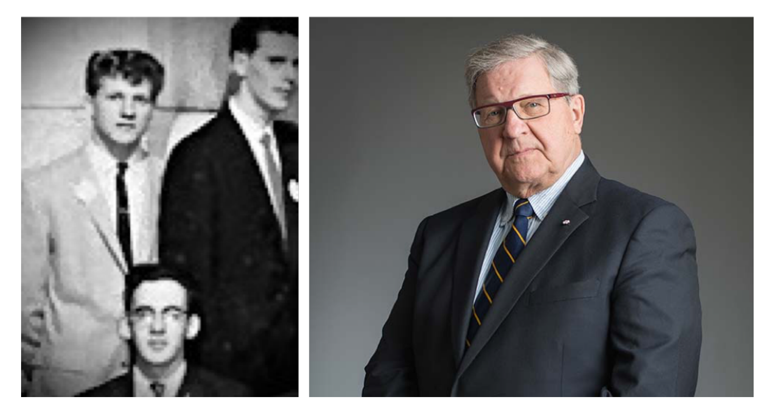
Left: Lloyd Axworthy in 1957, Deputy Minister of Religious Affairs of the Tuxis and Older Boys' Parliament. Right: Lloyd Axworthy