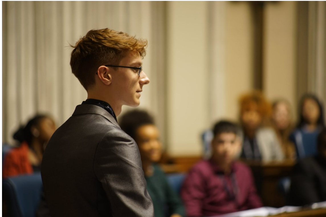
The 98th Winter Session (2019)

There is a particular shortage of photos from 1975-2010. If you attended during those years, it would be a wonderful help to receive some photographs. A big thank-you to the alumni who have already contributed to this project!