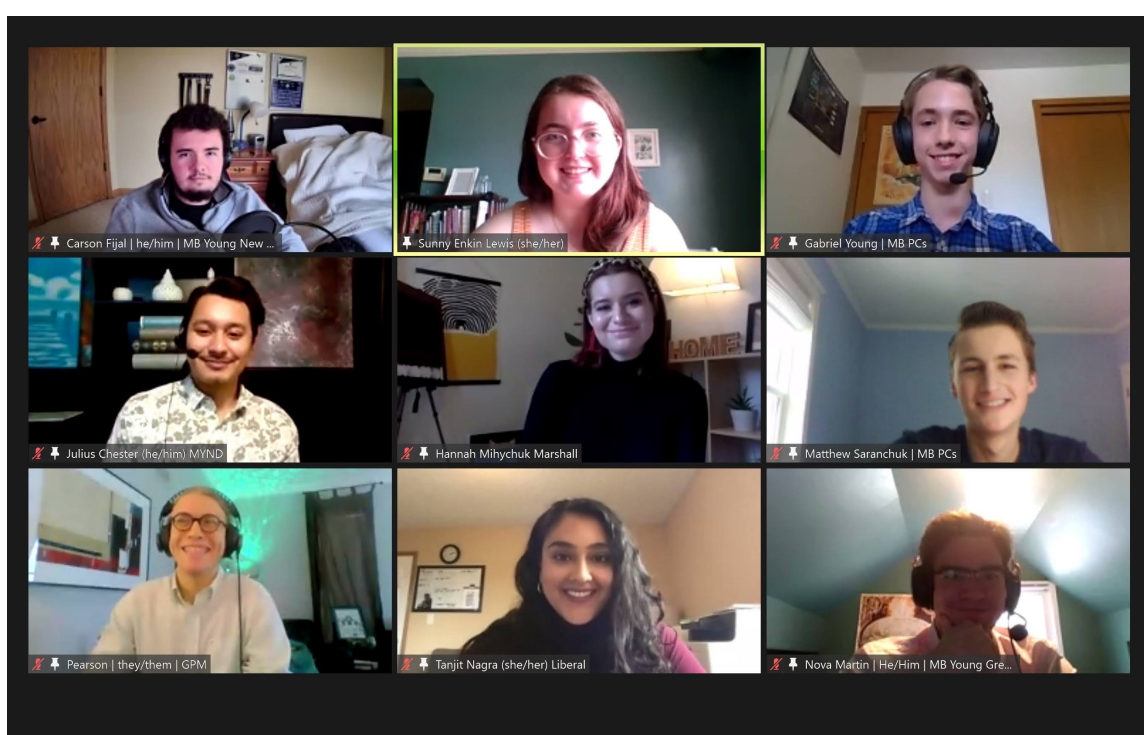
Youth representatives speaking at the Youth in Politics Q&A

Welcome to this issue of the Youth Parliamentarian - your alumni newsletter for updates about the Youth Parliament of Manitoba. In this issue, you will find a recap of our recent Youth in Politics Q&A , an exciting new grant received , and a call for photo submissions .