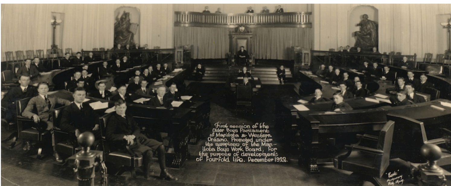
December, 1922: A view from inside the chamber of the 1st Session of the TUXIS Older Boy's Parliament