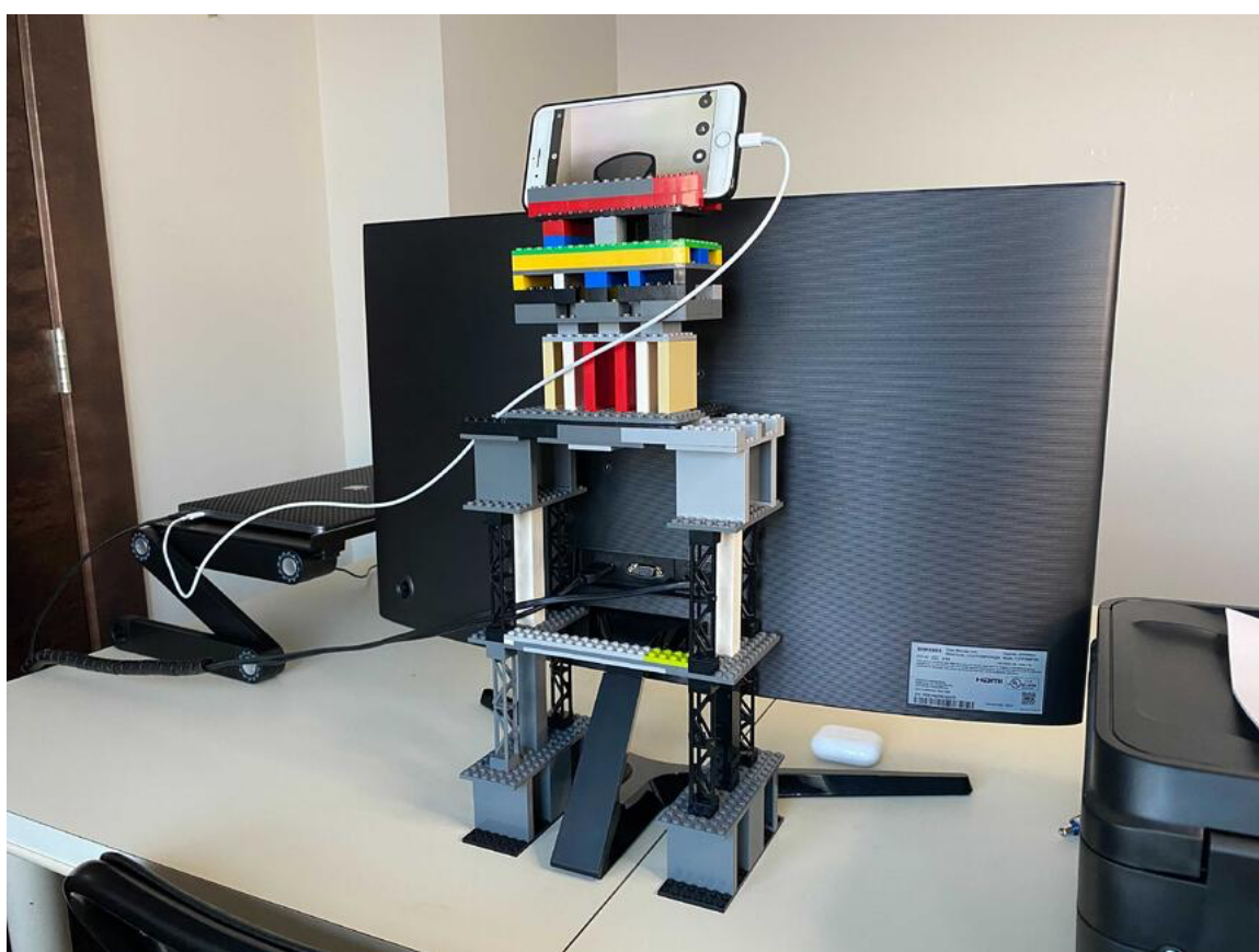
A DIY phone stand made of Legos serves as a makeshift webcam for our Ministers of Zoom Affairs, responsible for technical support during Winter Session.