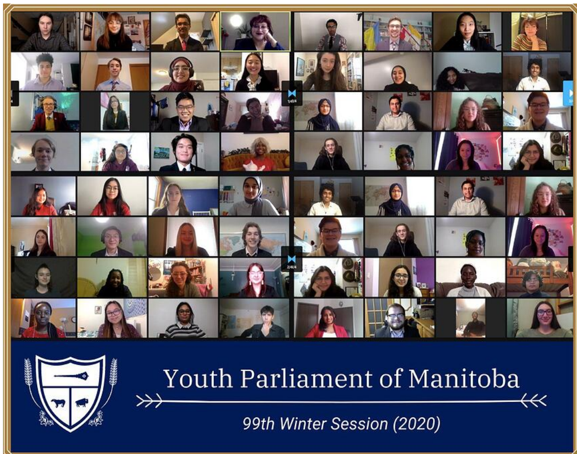
A group photo of the members attending the 99th Winter Session.

Happy New Year! In the YPM community, a new year is always accompanied by the close of another Winter Session. In this email, you will find a recap of the 99th Session, the first of its kind.