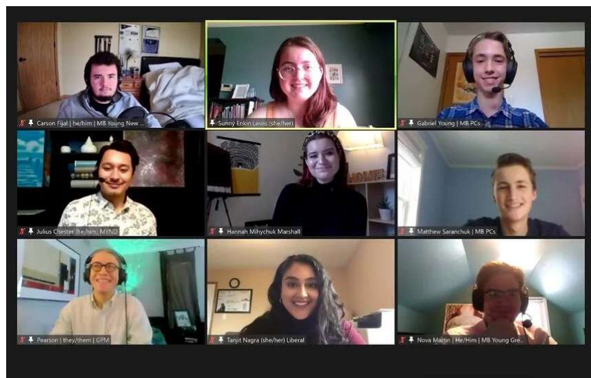
Youth representatives speaking at the Youth in Politics Q&A

Welcome to this issue of the Youth Parliamentarian - your alumni newsletter for updates about the Youth Parliament of Manitoba. In this issue, you will find a recap of our recent Youth in Politics Q&A , an exciting new grant received , and a call for photo submissions .